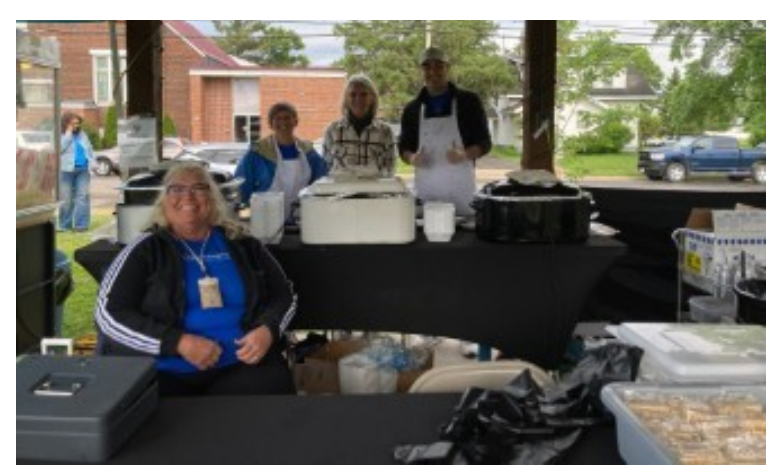
We'd like to give a big THANK YOU to everyone who stopped by to our Lefse Supper at the Garber Bandshell! We appreciate all of you and hope you enjoyed the food. See you again on July 14!